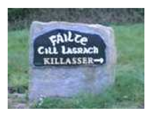
Issued by Killasser/Callow Parish Pastoral Council June 2006