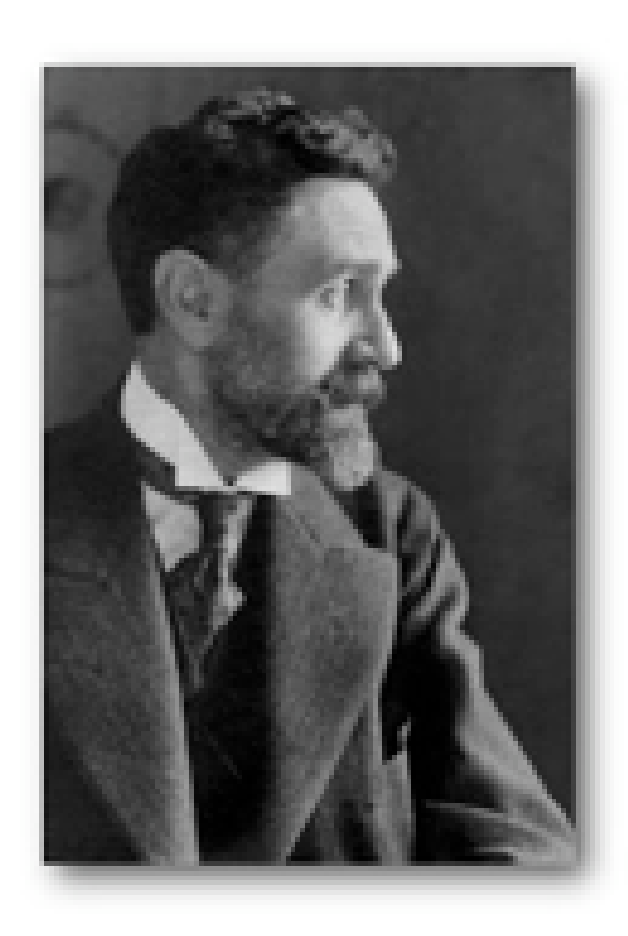
The Casement Outlook Venezuela: The Next stage of the Global Oil Wars by turoe

"You have the freedom here to do what you want to do with your money, and to me, that is worth all the political freedom in the