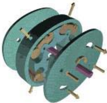
Figure 4. The Quasiturbine Steam Engine

engines can be operated with steam at low temperatures and pressures (200-400 °C, 25 bar).