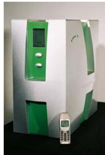
Figure 3. Enginion’s “Steam Cell

With changes in piston design, development of a compact steam generator and compressor, and the use of buffers for the steam and the condenser, the Swedish Ranotor system is promising efficiencies approaching 35%. The device includes two motors and two buffers intended to maximize time response to changes in load and efficiency. The focus is on keeping the steam engine oil free, as is the case with chillers and heat pumps where the working operates in