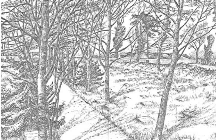
Old Moravian Church, Bishop Street, Dublin, and Moravian Cemetery, Whitechurch, County Dublin (the above and the cover illustration are reproduced from Short Accounts , plates vi, vii, viii)