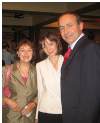
Nora Callanan, Hélène Duquin, Micheál Martin, Minister for Enterprise Trade and Employment at the opening of the International Cork Film Festival sponsored by the French Embassy