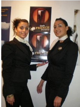
Carte Noire team distributing Festival brochures in Cork.