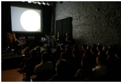
3pkano performing live to Sang d'un Poète at Triskel