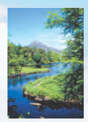
Discover the unspoilt beauty

Oughterard is called "the Gateway to Connemara", and offers an unforgettable and enjoyable stay to any visitor. The village, situated between the cosmopolitan city of Galway and the wilds of Connemara, makes Oughterard the perfect base to explore all the diverse activities, sights and experiences unique to the West of Ireland. In the village you will find a good selection of small bars and restaurants which are just a short walk from Camillaun Lodge.