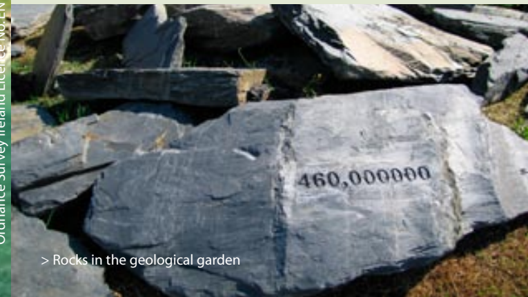
> Rocks in the geological garden