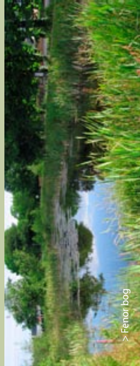
> Fenor bog

As above, from Fenor take either road at the first Y-junction and continue about 50 meters beyond where they rejoin take a lane to the right for Carrickavantry Lake with fishing for brown and rainbow trout. Look out for swan, heron, kestrel, hen-harrier and sparrowhawk as one walks to one side of the lake. Beyond it, at a left-hand turn, over the ditch is a small 4000 year old passage grave. At the end of this lane the way swings left and then right onto the tarred road across an interesting bog. Turn right at the crossroads for Fenor. As this can be a busy road in summer, a quieter option would be to go straight, turn right and right again at the two T-junctions, adding about 2 km to the journey.