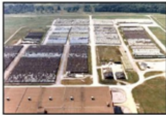
A Typical Cylinder Storage Yard

(7) http://www.vanderbilt.edu/radsafe/0001/msg00156.html