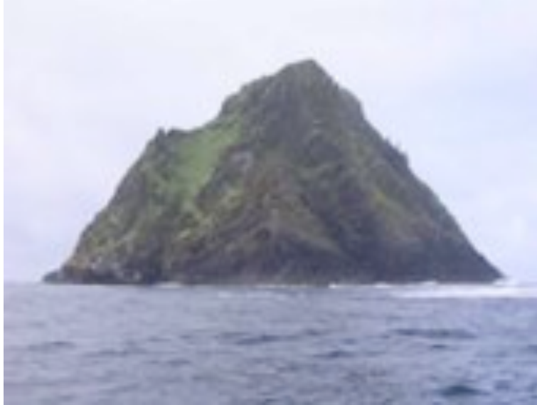
Sceilg Mhichíl (Skellig Michael)