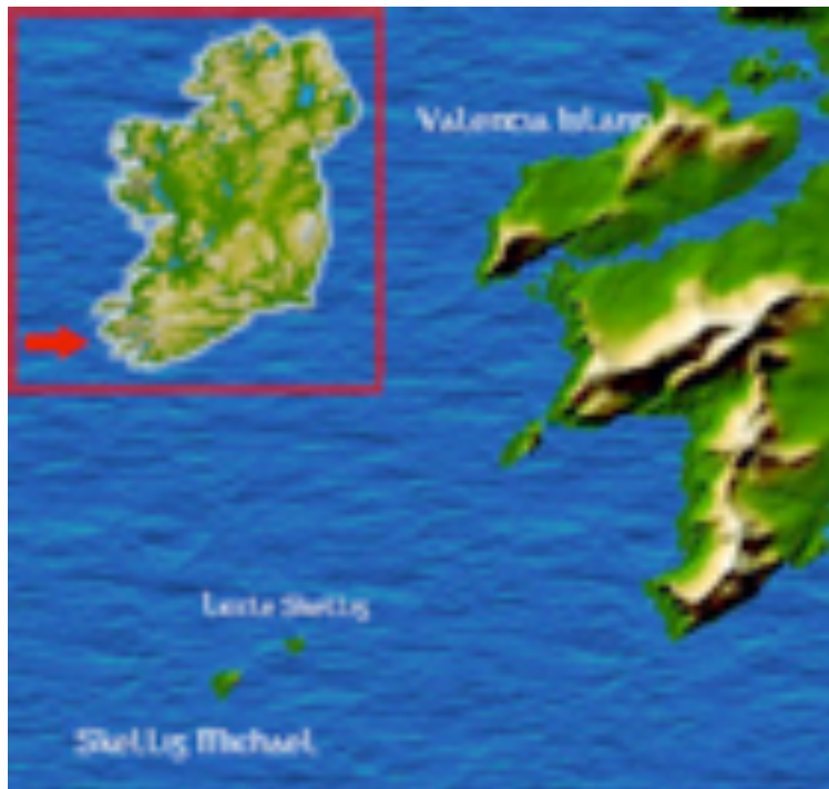
Sceilg Mhichíl in relation to the Irish coast