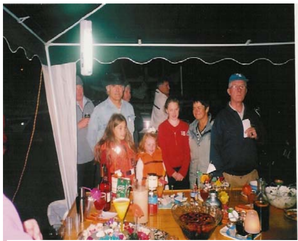
Some of the many impressive cocktails on display at the Commodores BBQ on July 26th.