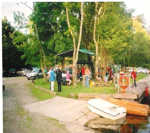
Busy night at the Club.

We had a much better summer this year than many previous ones, and this was evident with a very busy club harbour all season with everyone enjoying the great facilities of our new showers and toilets.