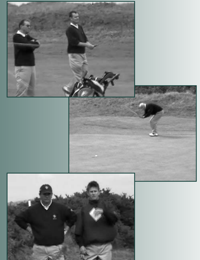
Scenes from the Irish Senior Cup Finals in Rosslare.

The AGM of the ladies club will be held in the clubhouse at 8pm on Monday November 28 th – please support your club by attending this important meeting.