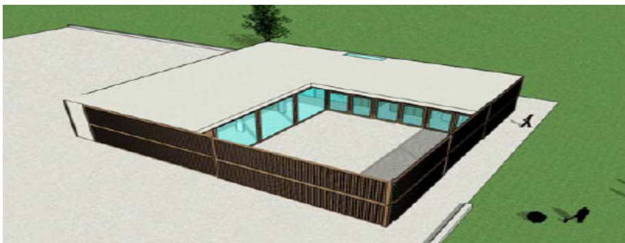
view of building closed

"To encourage as much participation by the local community a square or plaza has been included to be used for community activities, such as farmers markets, school exhibitions, and what ever activities the community see fit. Activities in the community that might be otherwise happen behind closed doors can be performed in public space. The building aims to contribute to the community beyond providing a basic shelter for activity. It is envisaged that the building will be a generator of a more pedestrian friendly neighbourhood centre, with increased activity thus contributing to a more village like atmosphere in the neighbourhood. The open nature of the building will be inviting and encourage use of the park by acting as a gate which encourages access rather than being difficult to find. The presence of people will make for a safer place for children's activity and play."