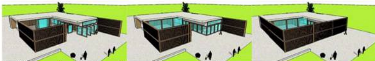
The building as viewed from the south, open, half open, and closed