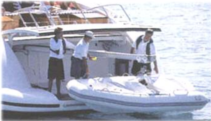
The compact profile (0.85 m) of the ProJet makes it perfect for yacht storage in confined areas.