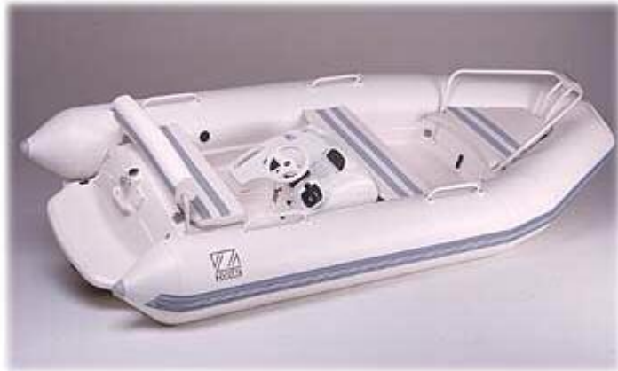
ProJet 350 and 420 (pictured above) models available