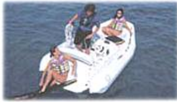
Ideal to pull a skier, the ProJet has a water ski towing ring and a swim platform.