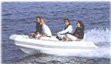
The ProJet planes easily with 4 passengers.