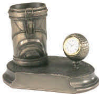
U19 Golf Bag & Clock (4.5'')