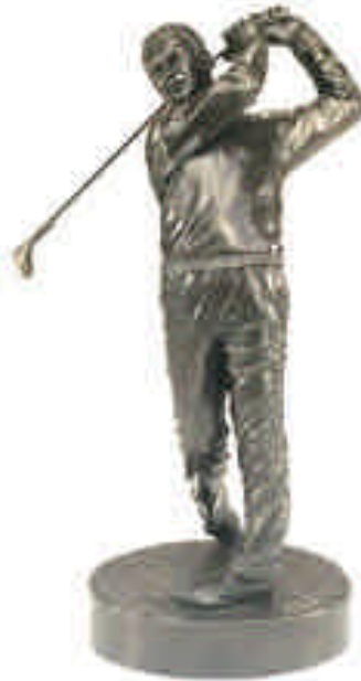
F2 The Swing (12'')