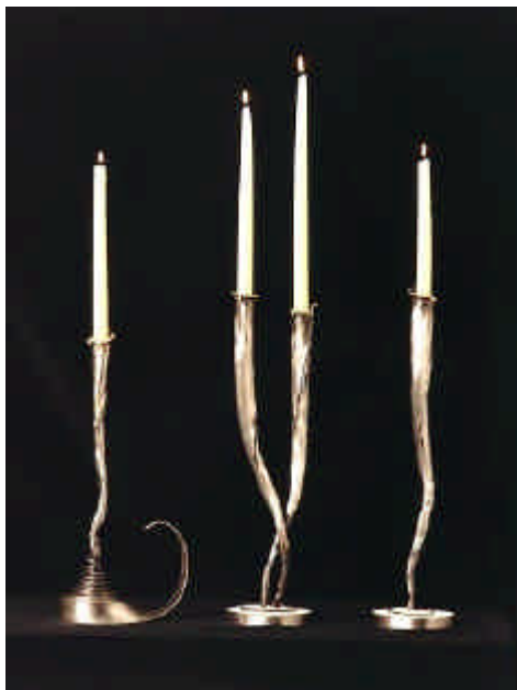
NIGHTLIGHT, DUO AND SINGLE

(Please contact PromoCraft if you would like to view the complete range.)