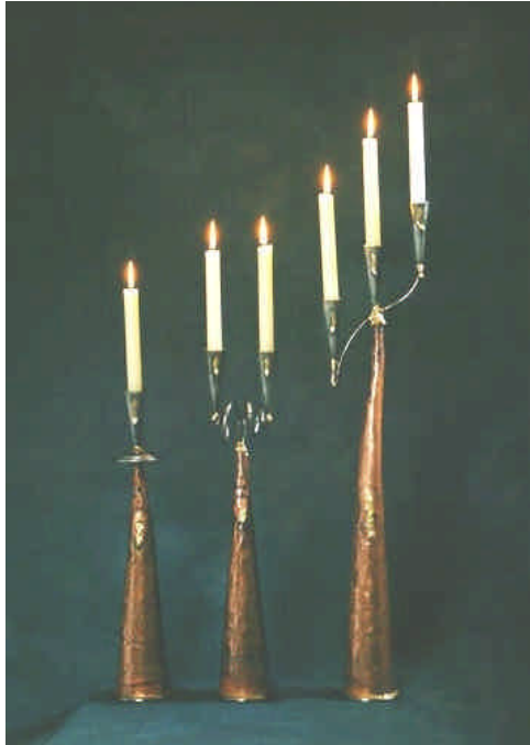
COPPER CONE LIGHTS