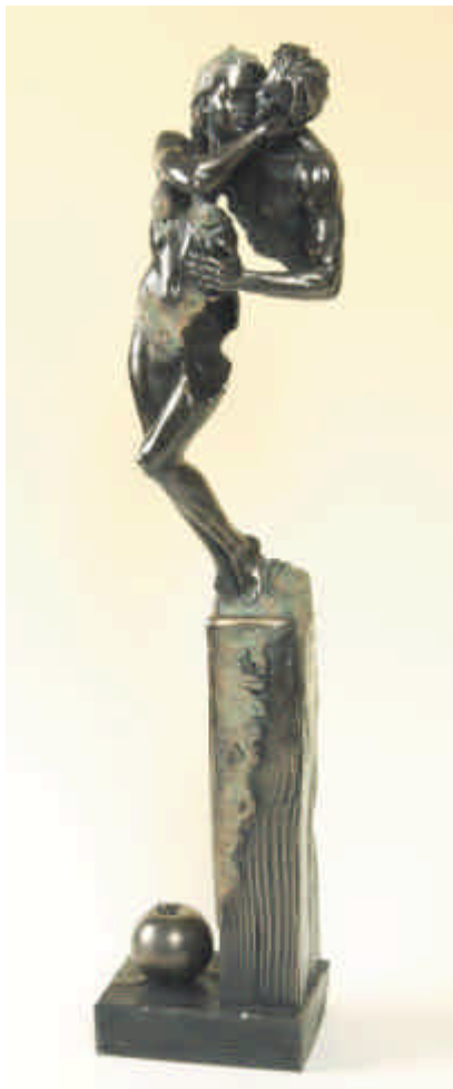
Z 17 Adam & Eve (H: 22")