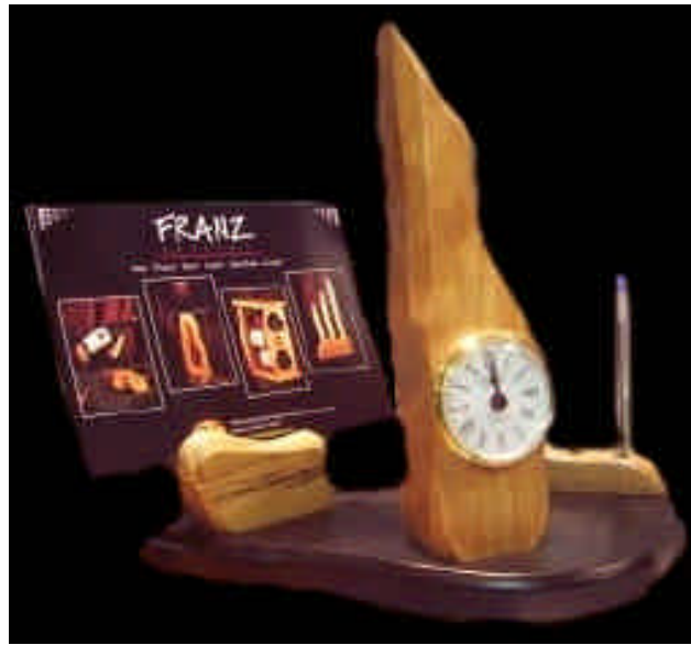
FR503 Executive Combi Set