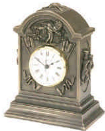
S25 Golf Clock (7.5'')