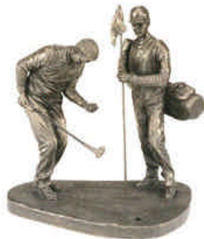
W23 Winning Putt (10'')