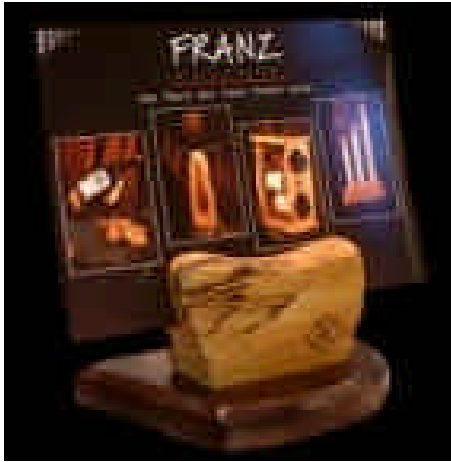
FR300 Business Card Holder