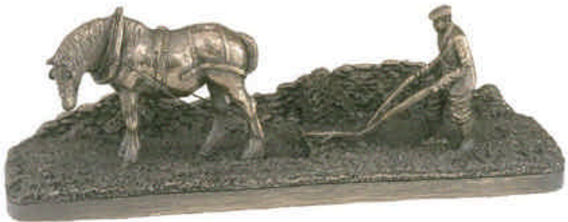
R62 The Ploughman (H: 4.5", L: 13")