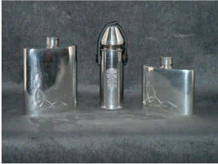
P104 Hip Flask-6oz, P101 Whiskey Flask, P105 Hip Flask-4oz