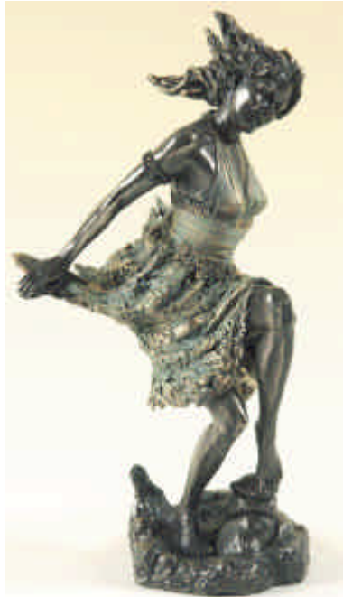
Z9 Spirit Of Joy (H: 11.5")