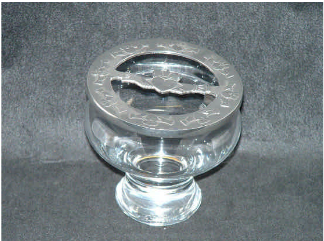
M99 – POT PUORRI DISH