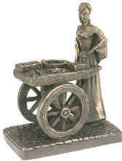
S6 Molly Malone (H: 6.5")