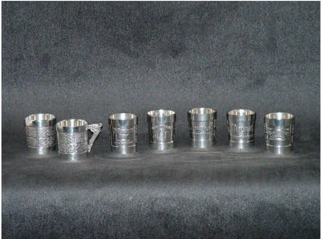
A18, A18H, A18B