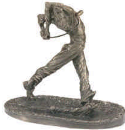
J4 Big Hitter (9.5'')