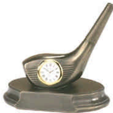
S26 Golf Club Clock (6'')