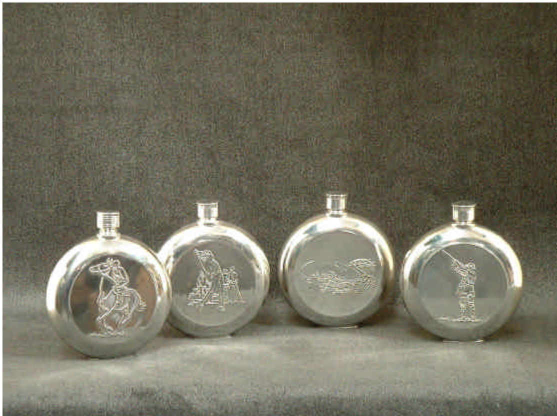
J7 – POCKET WHISKEY FLASKS