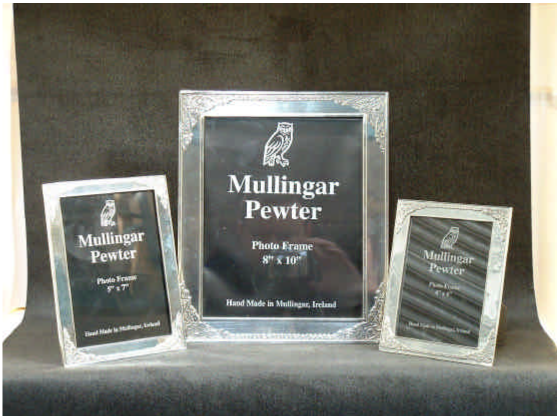
P128, P127 & P129 KELLS PICTURE FRAMES