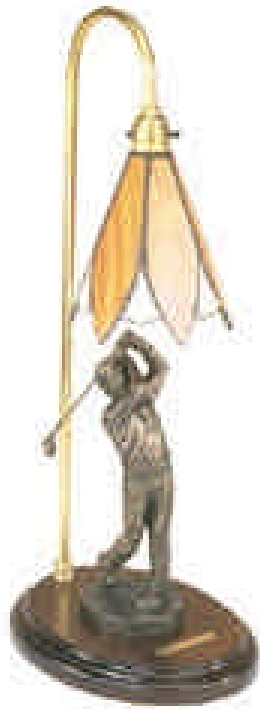
P3 Medium Swing Lamp (22'')