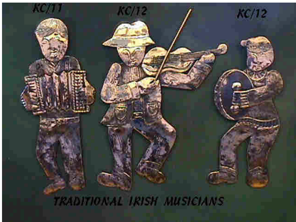
The Fiddler Player

Step into any good Irish Pub and you are likely to hear lively jigs and reels, foottapping hornpipes and sad lilted laments played on these traditional Irish Instruments-the Fiddle, the Accordion and the Bodhran.