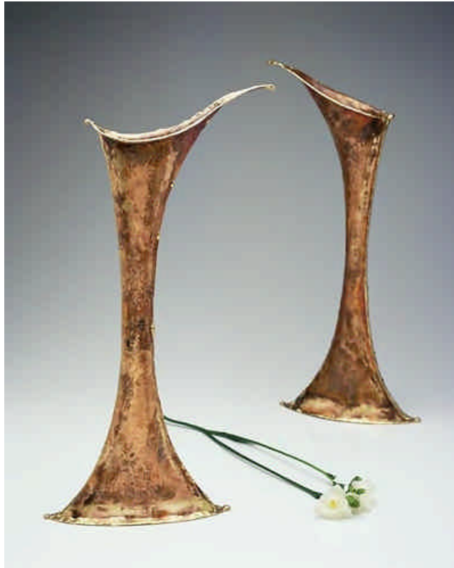
COPPER CONE VASE