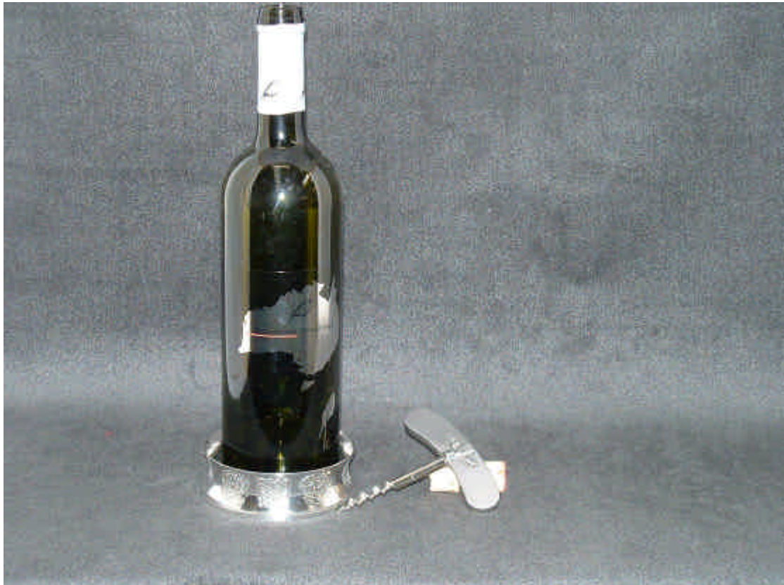
P120 CORK SCREW & P193 WINE COASTER