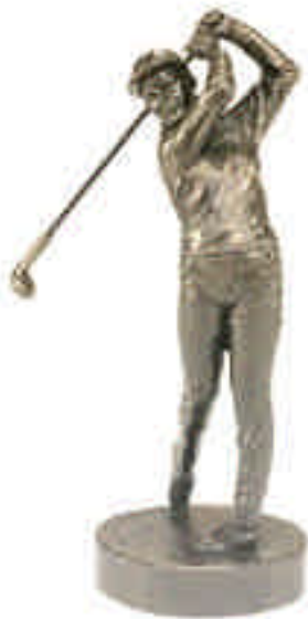
V23 Ladies Swing (8'')