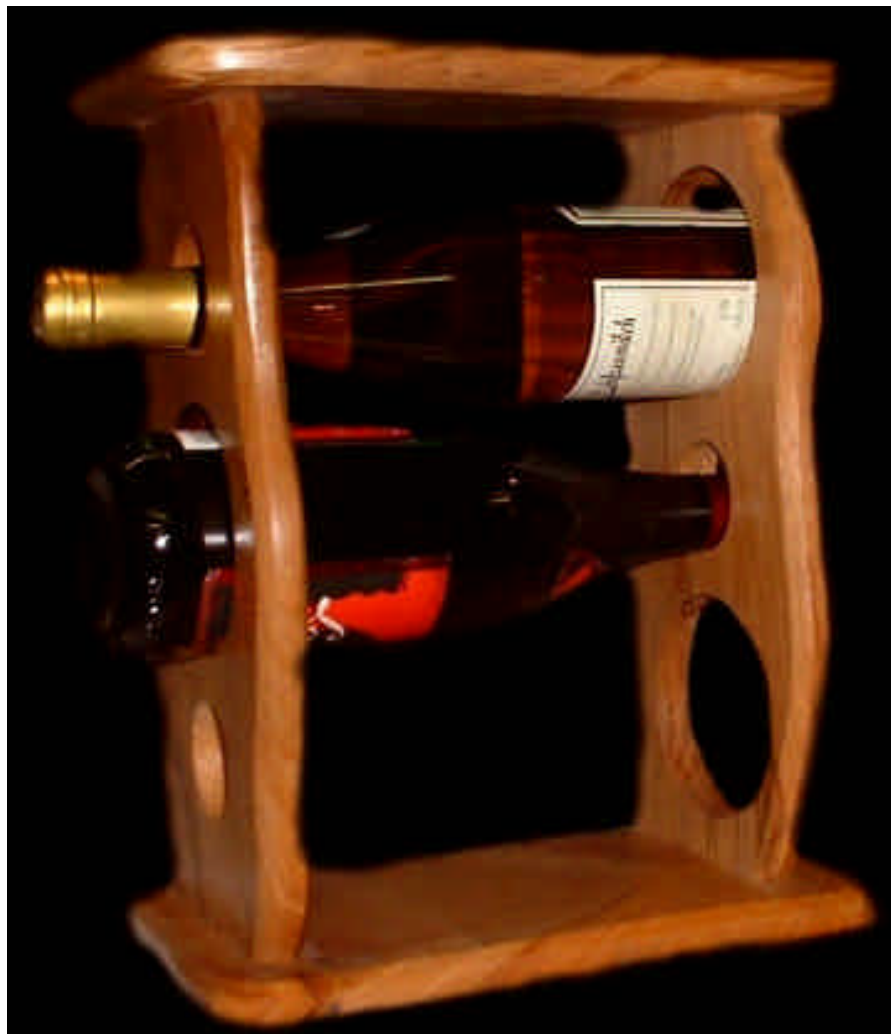
FR203 3 Tier Wine Holder