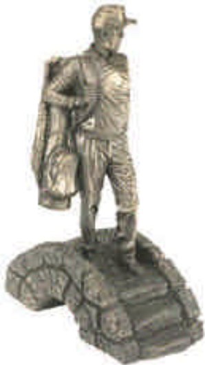
S24 On the fairway (11'')