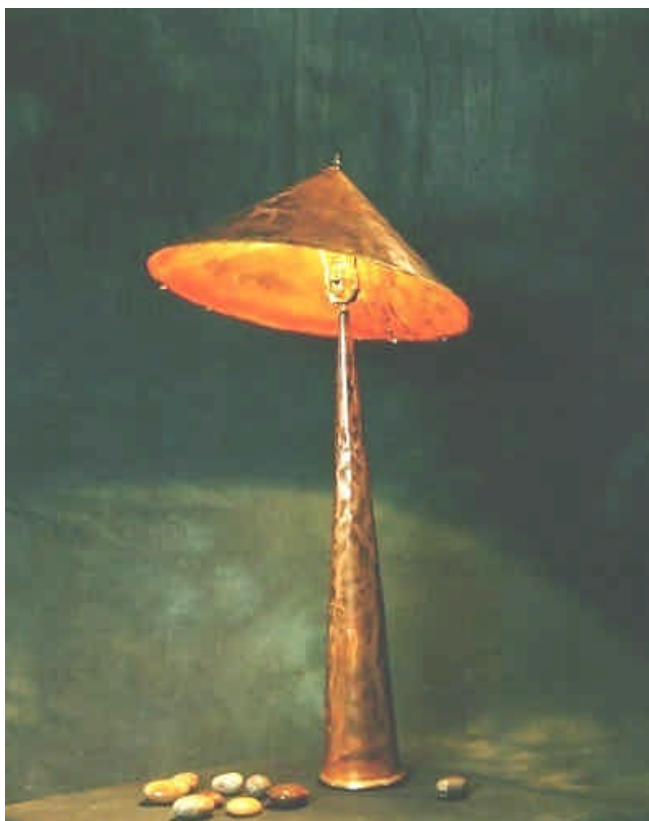
COPPER CONE LAMP