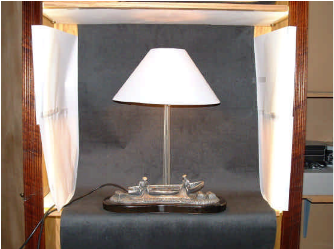
L37 DOWN THE FAIRWAY (may be purchased as a sculpture or a lamp)