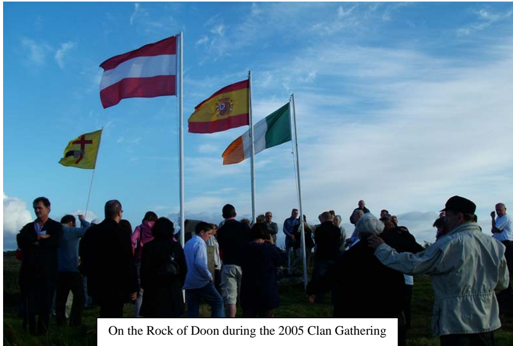
On the Rock of Doon during the 2005 Clan Gathering