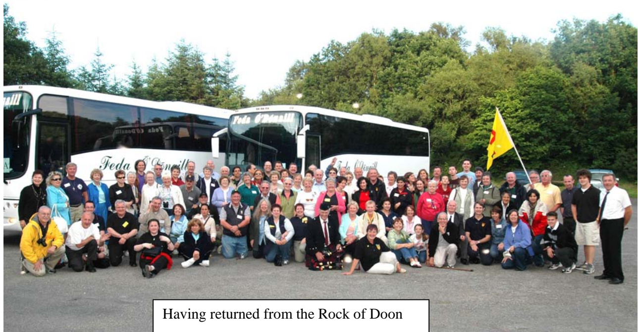
Having returned from the Rock of Doon