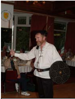
Our Red Hugh