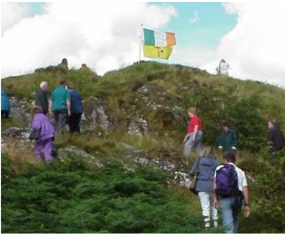
above: 2005 Clan Gathering, below: now

It was an illegal act. It is now being investigated by the National Monuments Services. A letter from you, or from a concerned group expressing anger and concern could greatly help in having the damage partially undone. It can never be totally undone.