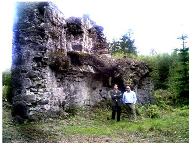
Counts Douxi and Rory at the old O'Donnell Castle at Loch Eske

The ruins of the old O'Donnell Castle at Lough Eske has for long lain derelict and ivy covered with daylight blocked by the forest around it. Now the ivy has been removed, the trees cut back and for the first time in centuries it is possible to walk around and appreciate it. The clearance is due to landscaping of the entire area for the new 5 star hotel being built there. Counts Douxi and Rory O'Donnell from Austria visited it during their brief stay in September.