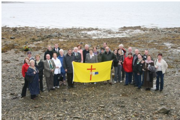
Members of the O'Donnell Clan Association and friends at Portnamurry on the 15 th September.