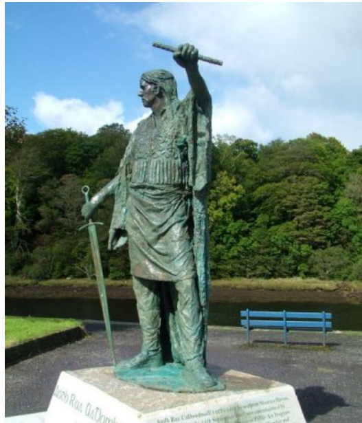
Aodh Rua Ua Domhnaill looks out at Donegal Bay